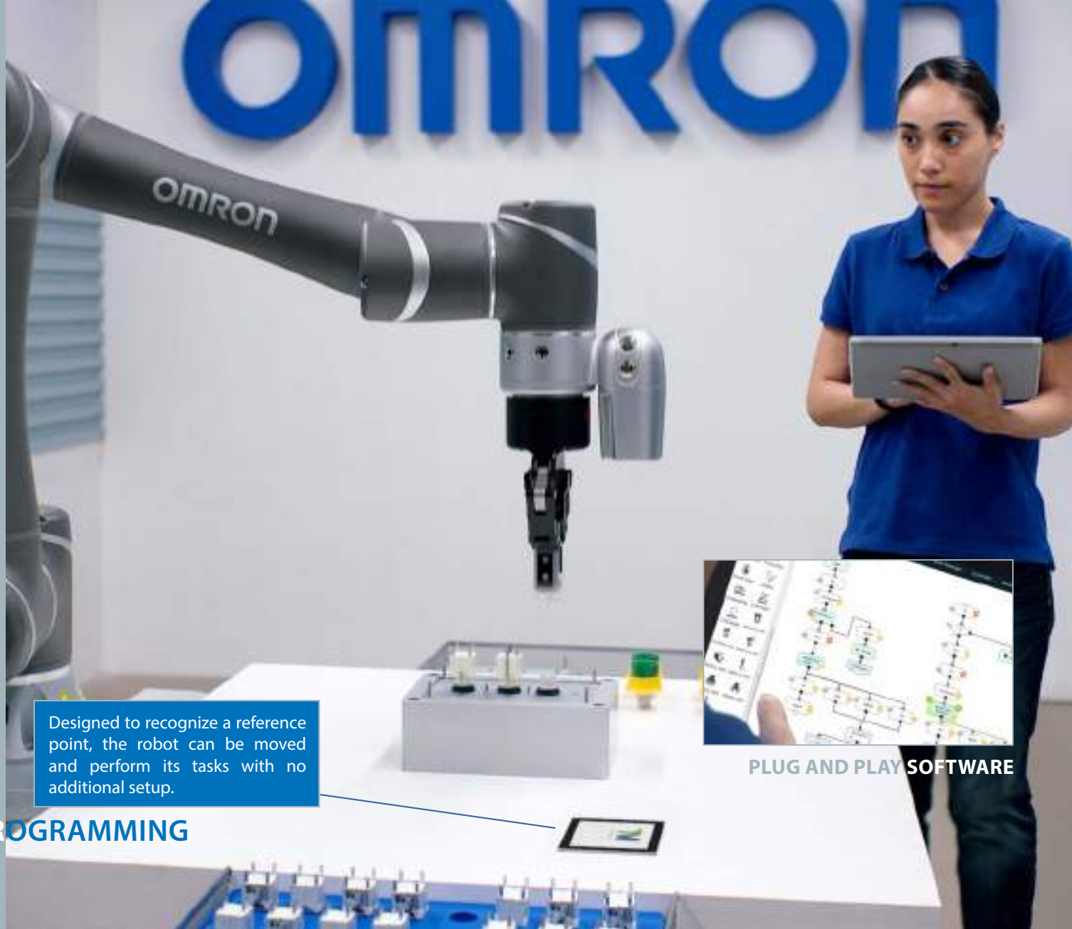
PLUG AND PLAY SOFTWARE